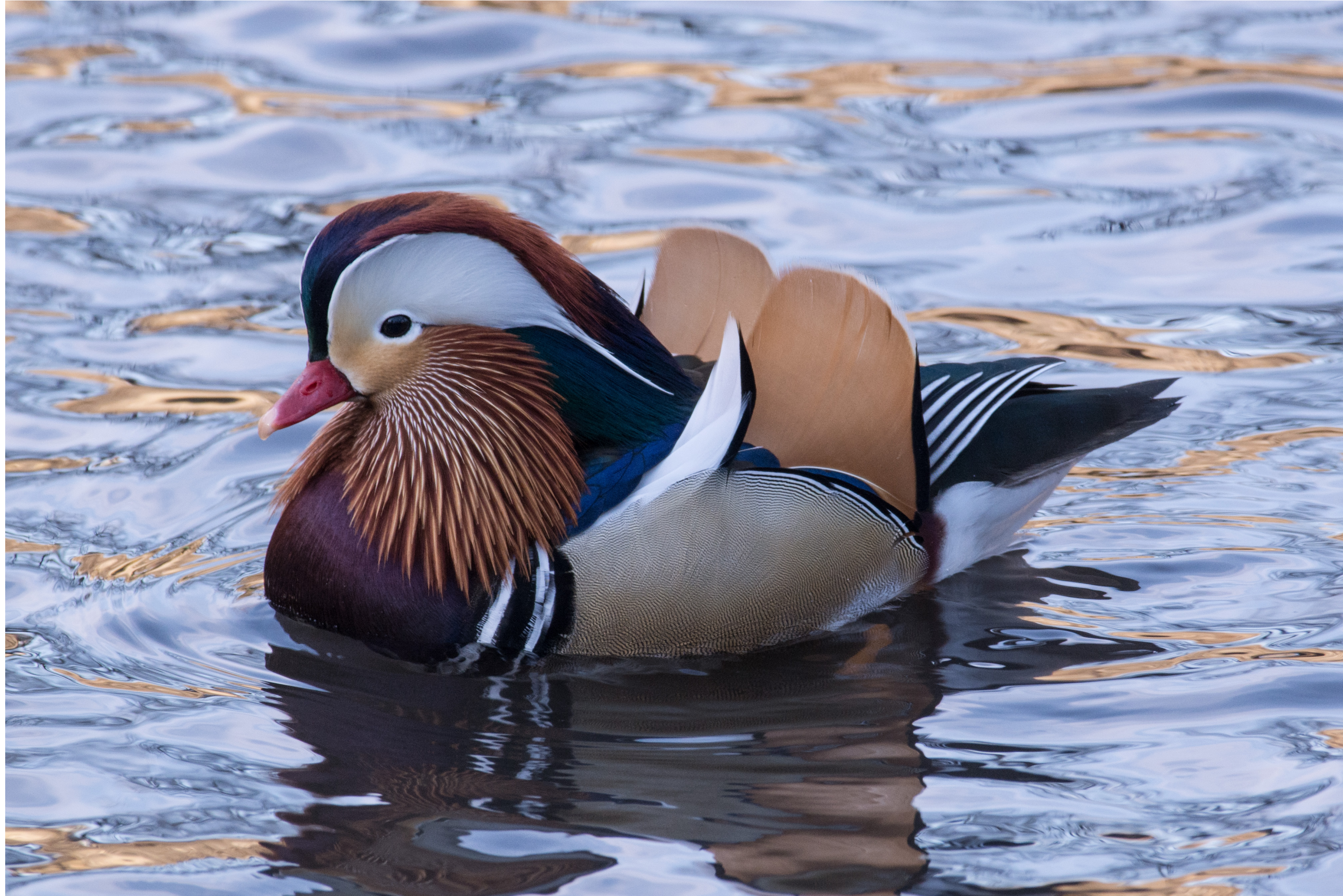
(Mandarin duck, Central Park, January 11, 2019)