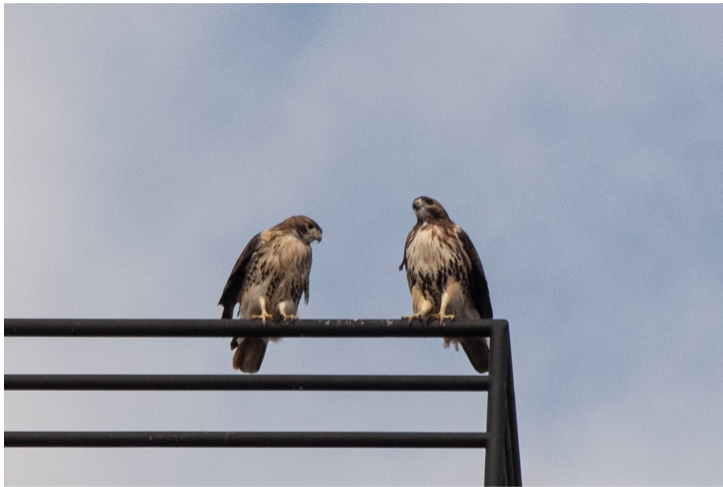
(Red-tailed hawks, East Campus dorm, November 21, 2021)