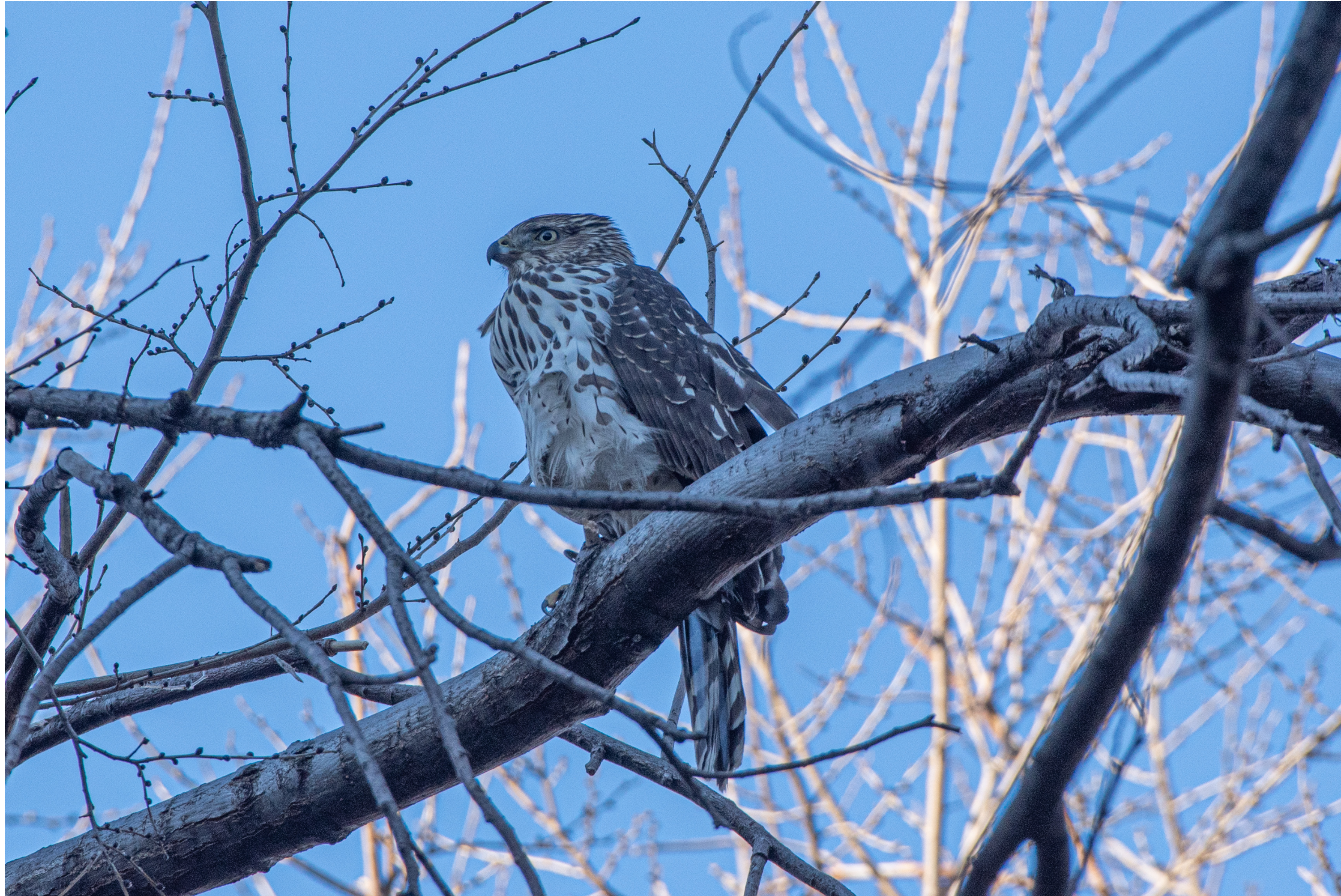
Cooper's Hawk, Morningside Park, January 29, 2021