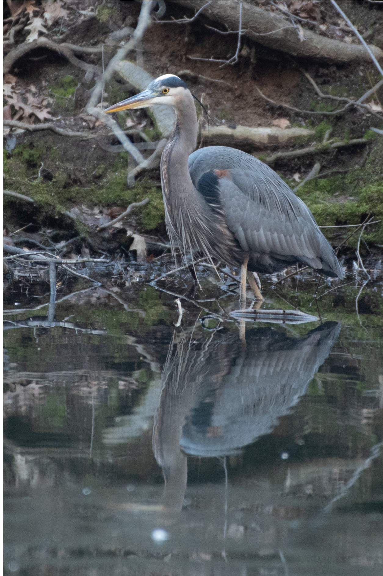
(Great blue heron, Central Park, January 22, 2020)