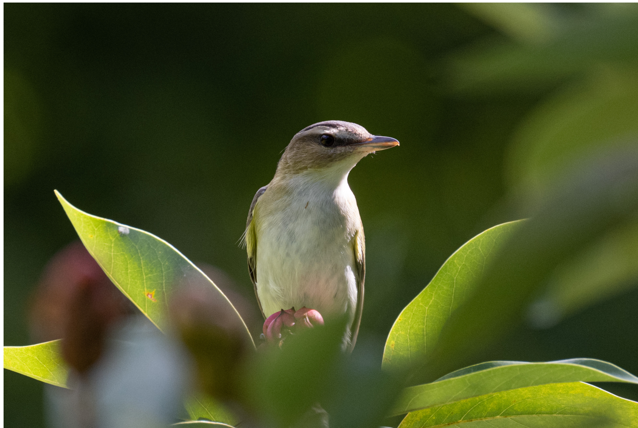
Red-eyed vireo, Central Park, August 31, 2022