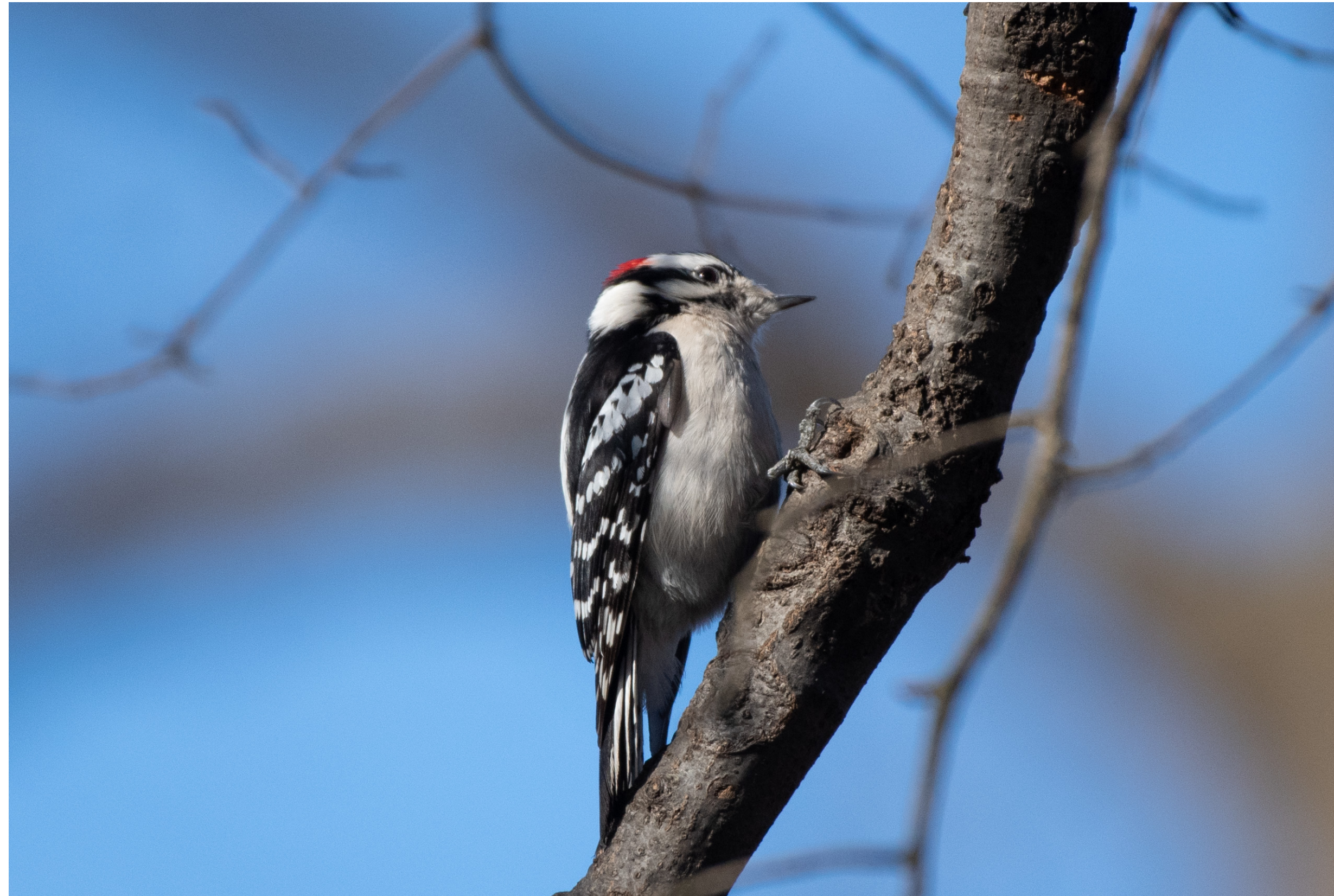
(Downy woodpecker, Central Park, March 1, 2020—this bird doesn't migrate...)