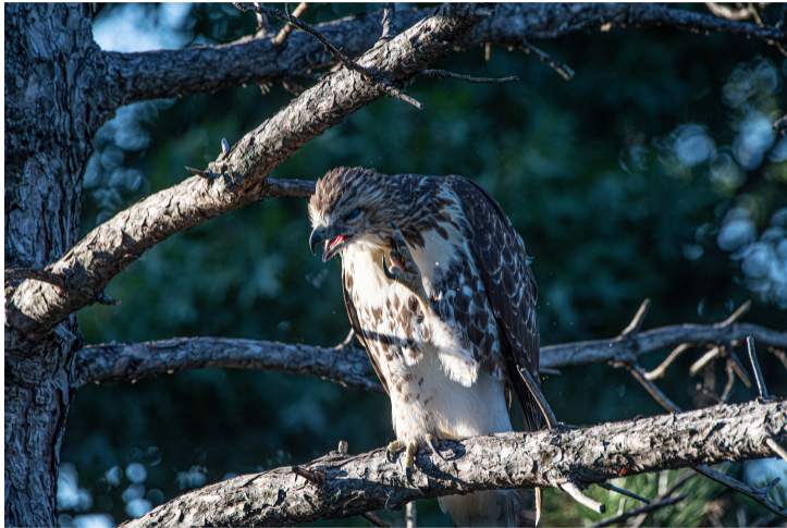
(Juvenile red-tailed hawk, Central Park, September 11, 2021)