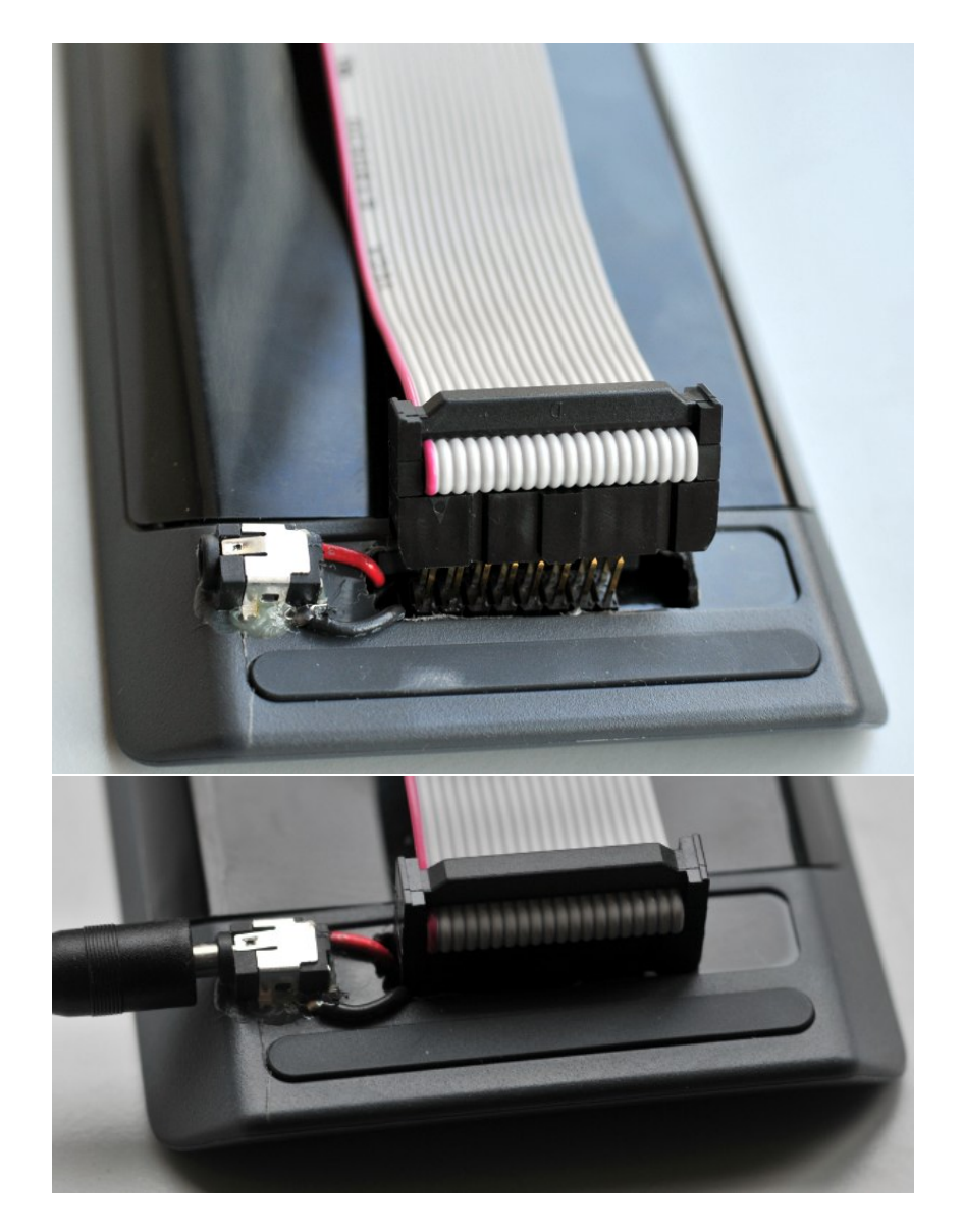
Figure 3: Connecting to the development ports on the back of the HP 20b calculator. Note that the JTAG connector extends beyond the header and we are not using the external power jack.