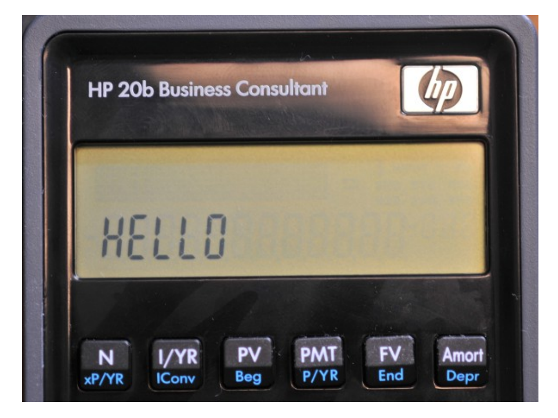
Figure 5: Running the "Hello" program