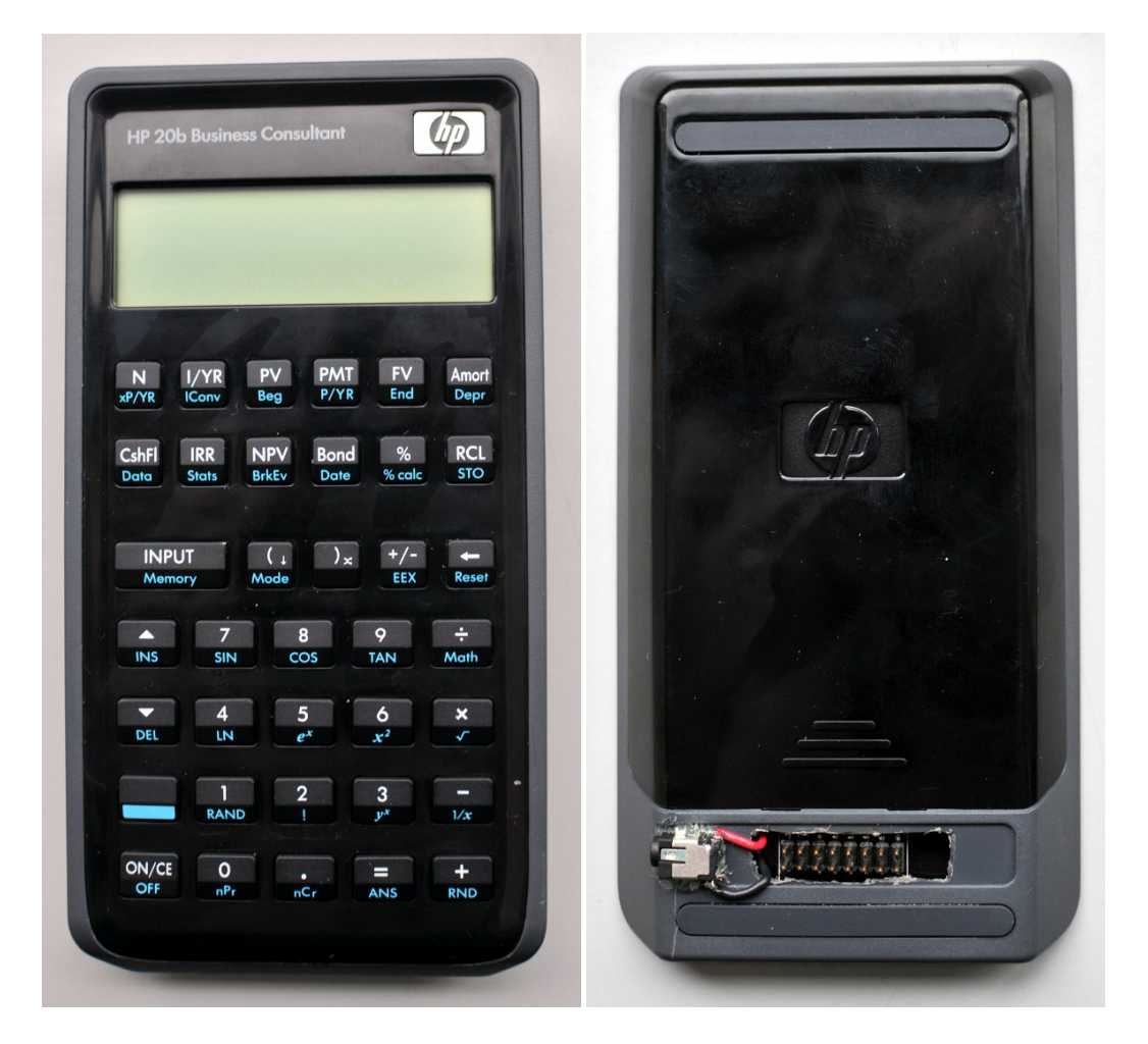
Figure 1: The front and back of the HP 20b calculator. I cut a hole and added the JTAG header so we could develop software on these.