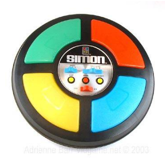
Figure 1: Hasbro's Simon

ance. Matching strings imply a successful pairing session, whereas non-matching strings imply that an attack has occurred. OOB strings can be transferred between the devices with a user's assistance, e.g., traditionally by transferring numbers [7]. The devices can compare these values to determine the outcome of pairing. An adversary is allowed to eavesdrop upon the OOB strings in this approach, but he or she cannot modify them.