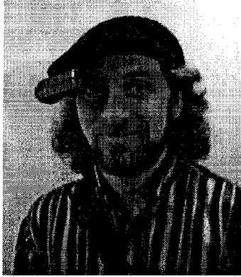
Figure 2: The heads-up display for the wearable platform.

Several systems also exist to provide contextual cues for managing information on a traditional desktop system. For example, the Lifestreams project provides a complete file management system based on time-stamp [Freeman and Gelernter, 1996]. It also provides the ability to tag future events, such as meeting times, that trigger alarms shortly before they occur. Finally, several systems exist to recommend web-pages based on the pages a user is currently browsing [Lieberman, 1995] [Armstrong et al., 1995].