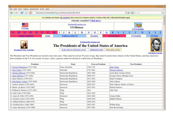
Figure 1: A typical use of the table tag to describe relational data. The relation here has a schema that is never explicitly declared but is obvious to a human observer, consisting of several typed and labeled columns. The navigation bars at the top of the page are also implemented using the table tag, but clearly do not contain relational-style data. WEBTABLES attempts to extract only true relations, including appropriate column labels and types.

structure, the basic unit for reading or processing is the unstructured document itself. However, Web documents often contain large amounts of relational data. For example, the Web page shown in Figure 1 contains a table that lists American presidents<sup>1</sup>. The table has four columns, each with a domain-specific label and type ( e.g. , President is a person name, Term as President is a date range, etc) and there is a tuple of data for each row. Relational operators like selection and projection would make obvious sense on this data. This Web page essentially contains a small relational database, even if it lacks the explicit metadata traditionally associated with a database.