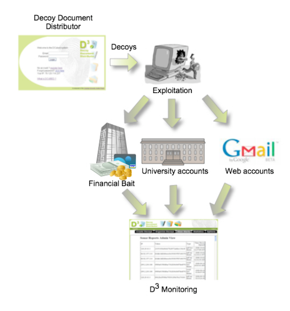
Fig. 1. Monitoring and deployment of bait decoys.

document and a decoy by analyzing the binary file format prior to opening a file. This necessitates a design where beacon code and watermarks in decoy documents are hidden to avoid their easy identification. The attacker would surely avoid the decoys if they could easily identify them by a simple static test for an embedded beacon. The beacon code can be embedded in documents in a number of ways and made to appear statistically equivalent to its surrounding data using a blending technique called "spectrum shaping" (see [22], [6]). Such obfuscation techniques are very hard to defeat [16].