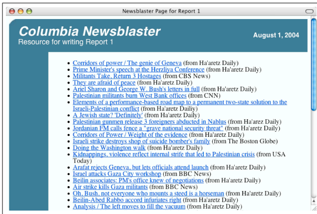
Figure 2: The evaluation interface screen showing the list of documents that a user sees in the no summary condition.

were peripherally related. 1 Hence there were sixteen clusters in the study overall. We selected the clusters by doing a manual search through Newsblaster clusters to find groups that were either peripherally or closely related. Each cluster contained, on average, ten articles. Subjects thus had to find relevant information within forty articles to answer in-depth analysis questions for each of four scenarios. While all of the articles were related to the scenario topic, only about half of the articles contained answers to the specific questions.