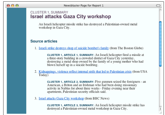
Figure 3: The evaluation interface screen showing a typical page for the single sentence summary condition. The user sees the summary and a list of articles each with its own summary.

the same page when Summary Level 1 and Summary Level 2 were used (Figure 3) or by clicking on the cluster name when Summary Levels 3 and 4 were used (Figure 4).