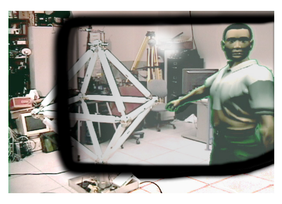
Figure 1: Our embodied agent Mirage is situated in the lab. Here we see how he appears to the user through the head-mounted glasses. (Image has been enhanced for clarity.)

way as articulated in Minsky's [1986] theory, that the mind is a multitude of interacting components, and his (perhaps whimsical but fundamental) claim that the brain is a hack.<sup>3</sup> In other words, we expect a working model of the mind to incorporate, and coherently address, what at first seems a tangle of control hierarchies and data paths. Which relates to another important theoretical stance: The need to model more than a single or a handful of the mind's mechanisms in isolation in order to understand the working mind. In a system of many modules with rich interaction, only a model incorporating a rich spectrum of (animal or human) mental functioning will give us a correct picture of the broad principles underlying intelligence.