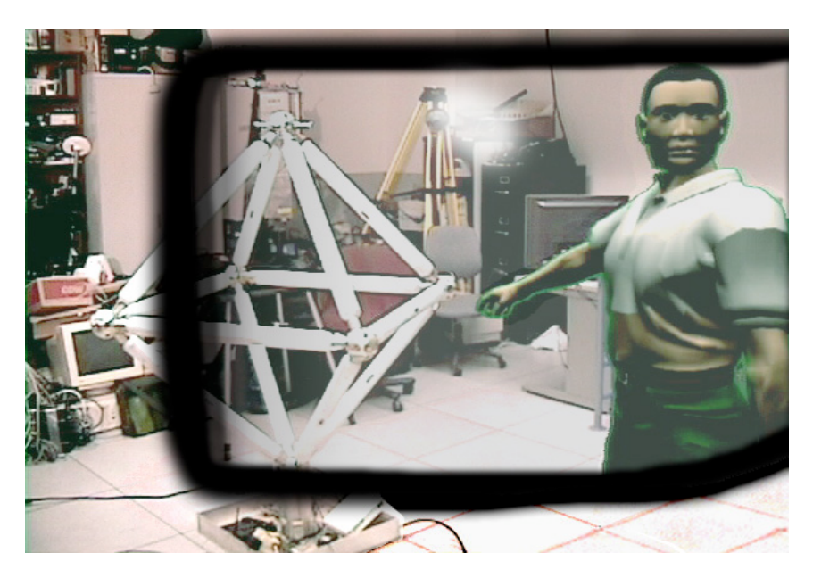
Figure 1: Our embodied agent Mirage is situated in the lab. Here we see how he appears to the user through the head-mounted glasses. (Image has been enhanced for clarity.)

theories in physics, we see the search for unified theories of cognition in the same way as articulated in Minsky's [1986] theory, that the mind is a multitude of interacting components, and his (perhaps whimsical but fundamental) claim that the brain is a hack.<sup>3</sup> In other words, we expect a working model of the mind to incorporate, and coherently address, what at first seems a tangle of control hierarchies and data paths. Which relates to another important theoretical stance: The need to model more than a single or a handful of the mind's mechanisms in isolation in order to understand the working mind. In a system of many modules with rich interaction, only a model incorporating a rich spectrum of (animal or human) mental functioning will give us a correct picture of the broad principles underlying intelligence.