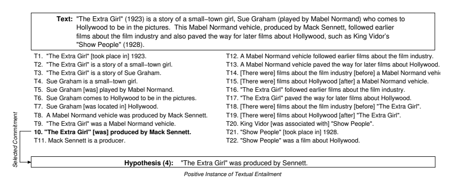
Figure 2: Text Commitments Extracted from Example 4 (RTE-3).

entailment computation module (described in Section 5), which estimates the likelihood that the selected c_{t_i} textually entails the c_{h_i} (and by extension, the likelihood that t textually entails h). Commitment pairs are considered in ranked order until a positive judgment is returned, or until no more commitments above a threshold remain.