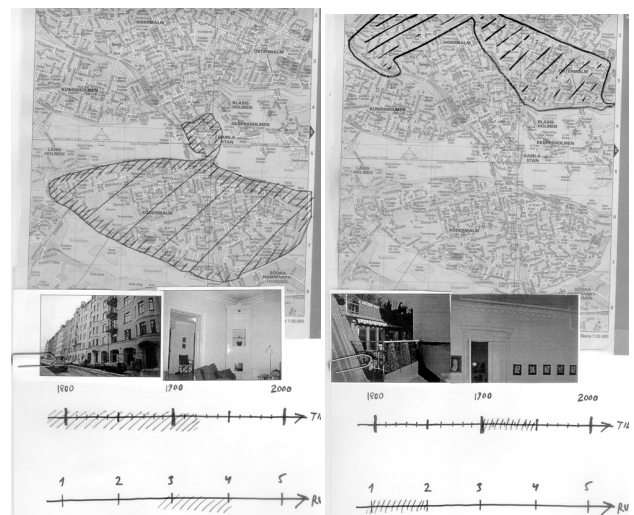
Figure 2. The scenarios, A on the left and B on the right.

Subjects were instructed that they could communicate with the system using an open microphone and two graphical operations with respect to the map, namely, the selection of a position by point-and-click and the selection of a rectangular area of arbitrary size. The subjects' graphical operations were echoed in the same way by the two system versions; in particular, a point-and-click on an apartment icon was echoed by highlighting the icon. 16 subjects, all volunteers, participated in the experiment. Eight of the subjects were female and eight were male, and their ages ranged from 17 to 55. The subjects were all native speakers of Swedish, and while a few of them were staff at the Department of Speech, Music and Hearing,