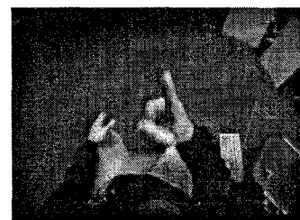
Figure 2: View from the tracking camera.

In the second method, the the hands were tracked based on skin tone. We have found that all human hands have approximately the same hue and saturation, and vary primarily in their brightness. Using this information we can build an a priori model of skin color and use this model to track the hands much as was done in the gloved case. Since the hands have the same skin tone, "left" and "right" are simply assigned to whichever hand is currently leftmost and rightmost. Processing proceeds normally except for simple rules to handle hand and nose ambiguity described in the next section.