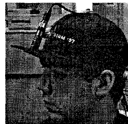
Figure 1: The baseball cap mounted recognition camera.

the resultant image that helps to prevent edge and lighting aberrations. The centroid is calculated as a by-product of the growing step and is stored as the seed for the next frame. Given the resultant bitmap and centroid, second moment analysis is performed as described in the following section.