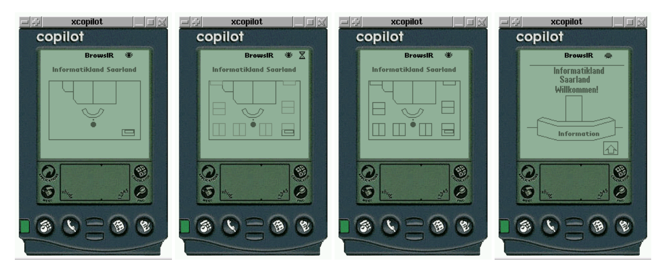
Figure 2. Screenshot of the hyperdocument browser software BrowslR. The initial presentation only contains the floor plan with the exhibit in question. Then additional exhibits are displayed gray and as information comes in they turn black to signal that they are clickable. A perspective view of the current location can be chosen by selecting your own position (black dot).

effect of the very working principle. Another advantage of optical transmission over radio cells is its sensitivity to orientation in space. A visitor of an exhibition might stand closer to one exhibit, but still look at another one. If a person has to be guided across a large building, the information that has to be shown (such as arrows or floor plans) depends not only on her position, but also on her walking direction. Similarly several senders can be installed in one position streaming different data in different directions. By making the simple assumption that the PDA is always held upright in front of the user we are able to position several senders in such a way, that, depending on where a person is facing from the same position, different information is displayed. The 3D space is thus augmented not only by location specific, but also by orientation specific information.