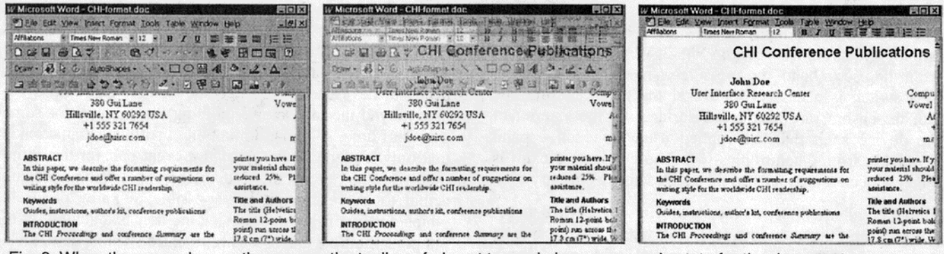
Fig. 3: When the user releases the mouse, the toolbars fade out to maximize screen real estate for the document.

[14]. Although some toolbars do provide visual indications of state (e.g. the current font and point size), most toolbars display no useful state information when the user is just looking at a document or entering text with the keyboard.