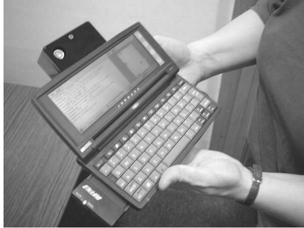
Fig. 3. The prototype receiver in use with a handheld computer.

worlds, and also to enable interaction with virtual performers; and for a user in a museum to provide a shared experience to a remote companion.