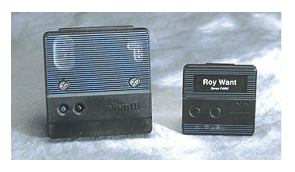
Figure 1. Olivetti Active Badge (right) and a base station (left) used in the system's infrastructure.

A general technique for providing recognition capability assigns names or globally unique IDs (GUID) to objects the system locates. Once a tag, badge, or label on the object reveals its GUID, the infrastructure can access an external database to look up the name, type, or other semantic information about the object. It can also combine the GUID with other contextual information so it can interpret the same object differently under varying circumstances. For example, a person can retrieve the descriptions of objects in a museum in a specified language. The infrastructure can also reverse the GUID model to emit IDs such as URLs that mobile objects can recognize and use.<sup>2</sup>