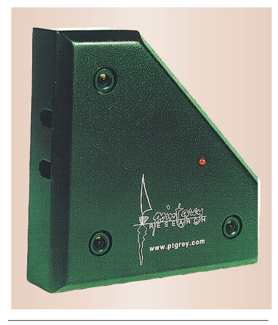
Figure 3. Digiclops color 3D camera, made by Point Grey Research and used by the Microsoft Research Easy Living group to provide stereo-vision positioning in a home environment.

vision systems typically use substantial amounts of processing power to analyze frames captured with comparatively low-complexity hardware.