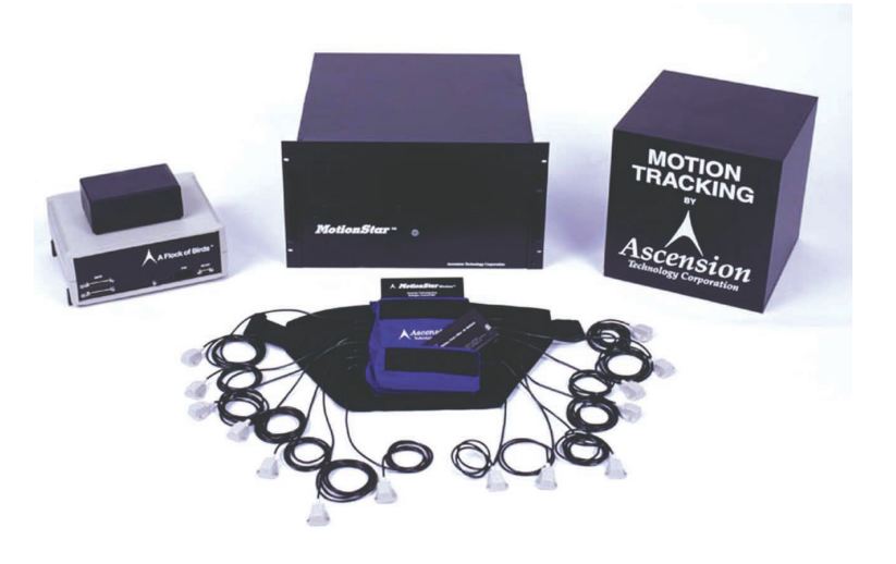
Figure 2. MotionStar DC magnetic tracker, a precision system used in motion capture for computer animation, tracks the position and orientation of up to 108 sensor points on an object or scene. Key components include (left and right) the magnetic pulse transmitting antennas and (center) the receiving antennas and controller.

Several groups have explored using computer vision technology to figure out where things are. Microsoft Research's Easy Living provides one example of this approach. Easy Living uses the Digiclops real-time 3D cameras shown in Figure 3 to provide stereo-vision positioning capability in a home environment.<sup>11</sup> Although Easy Living uses high-performance cameras,