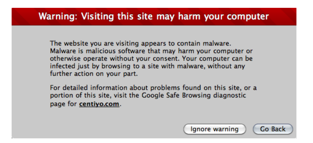
Figure 1: Google Malicious Site Warning