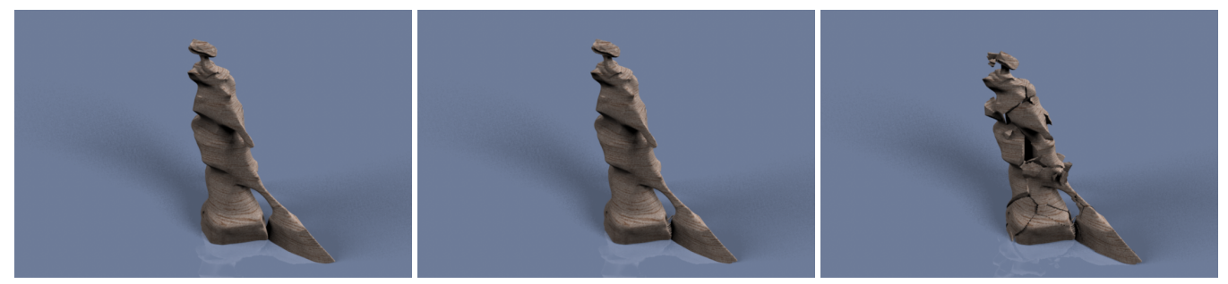
Figure 1: Fracturing a cliff. Left: The original surface geometry, Middle: the scan-converted, fractured, and reconstructed geometry at frame 1, Right: the fractured geometry at frame 25. Note the fidelity to the original geometry and preservation of sharp features.

Contributions To alleviate the laborious task of generating volumetric fracture pieces by hand while preserving the integrity of the artistically modeled shape, we develop a practical, robust, and effective solution for artistically directed volumetric fracture. Unlike previous approaches our procedural fracture system maintains intrinsic attributes (e.g., texture coordinates), preserves discontinuities such as texture seams, and generates procedurally fragmented "chunks" with seamless boundaries. The key steps in our fracture pipeline are: robust scan-conversion from an input geometry, generation of fragmented fracture pieces with artistic control, and high fidelity mesh generation of the disjoint fracture fragments.