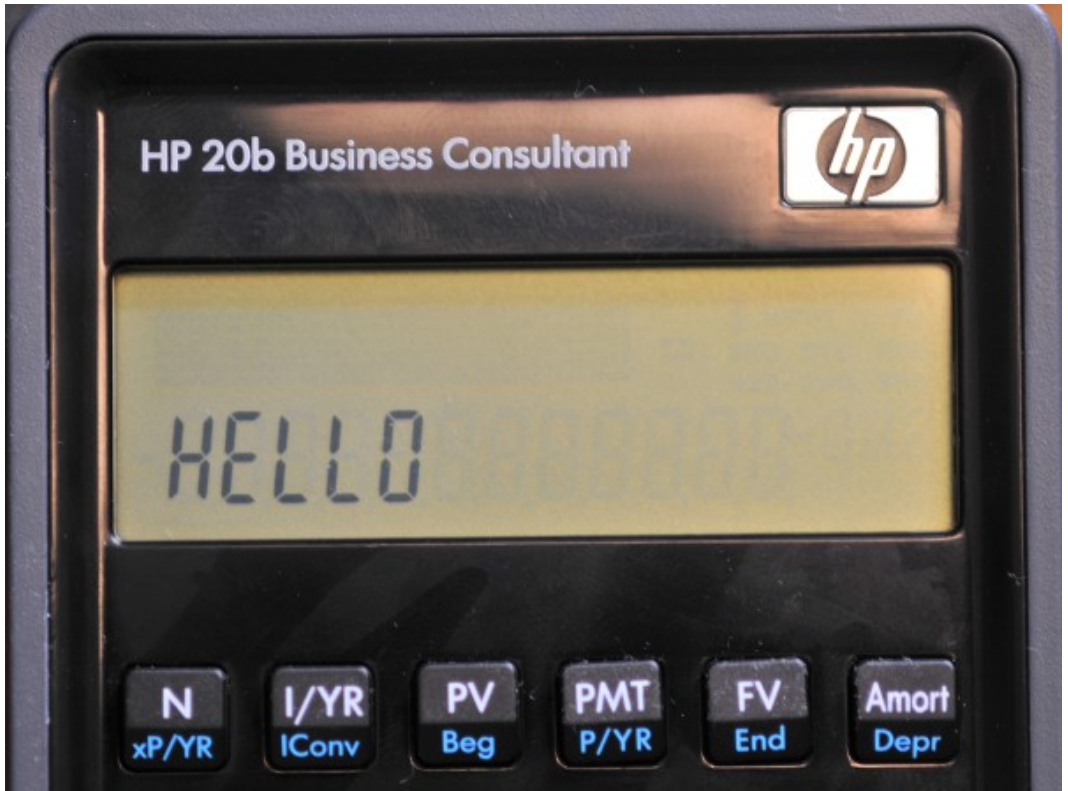
Figure 5: Running the “Hello” program