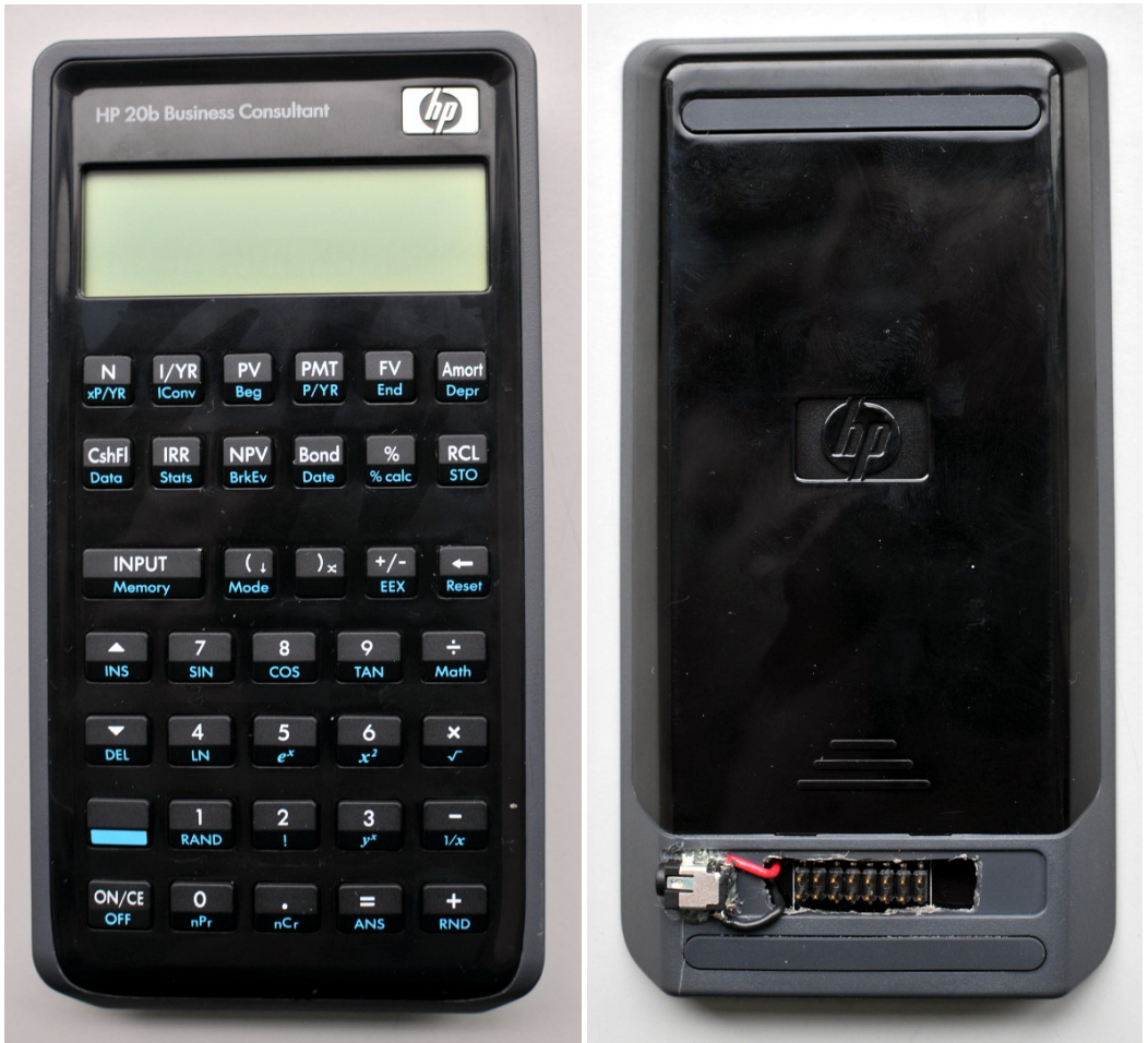
Figure 1: The front and back of the HP 20b calculator. I cut a hole and added the JTAG header so we could develop software on these.