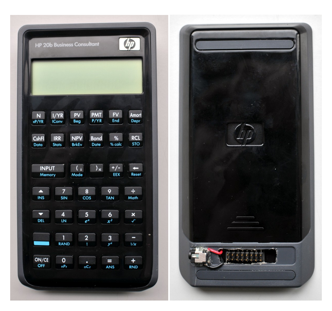
Figure 1: The front and back of the HP 20b calculator. I cut a hole and added the JTAG header so we could develop software on these.