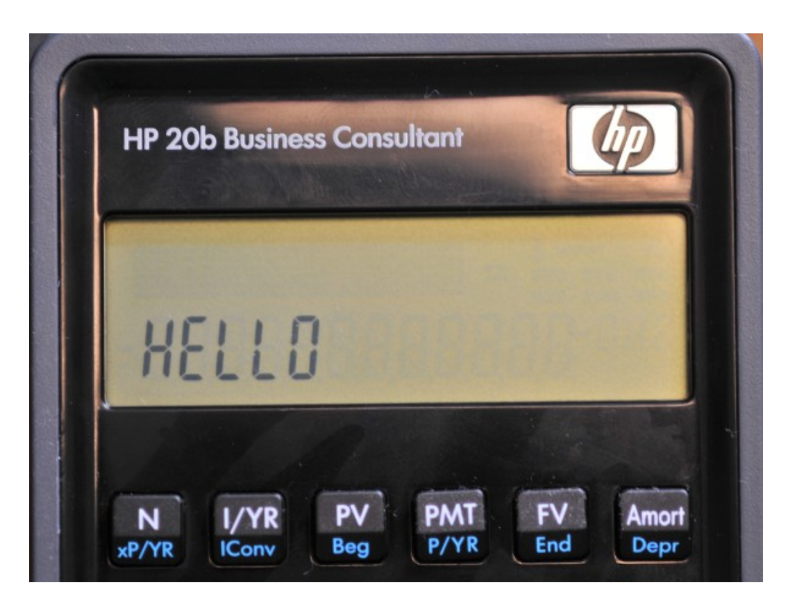
Figure 5: Running the "Hello" program