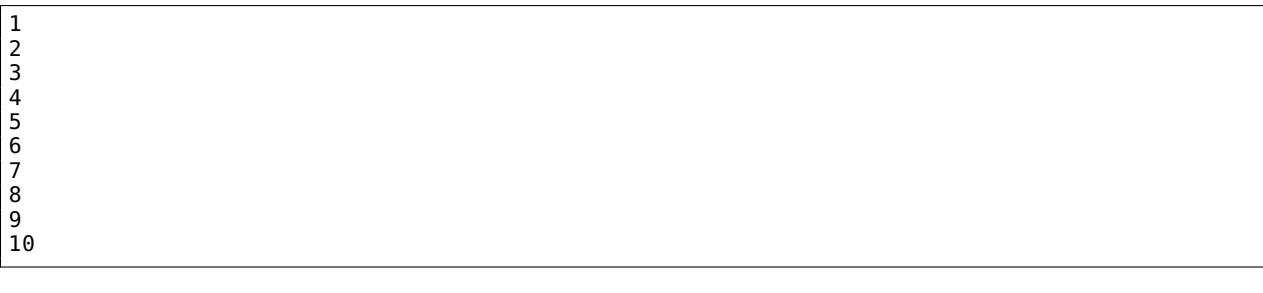
Listing 6.6: splitter.pls Input