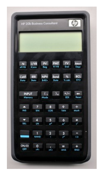
Figure 1: The HP 20b