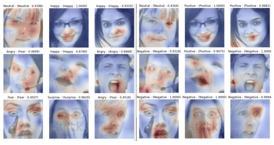
Figure 1: Contrast in attention heat maps across 9 random images: a CNN model trained on a 7-category dataset (left) vs. the same dataset categorized into 3 groups (right). Regions of high attention are shown in red.

Table 2: Experimental results from the MEmoR model and the CNN model. This table shows the overall accuracy of the models trained and tested on datasets reconstructed based on each 3 classification method. The highest achieved is bolded. The MEmoR model uses visual, audio, textual features. In the CNN model, only visual information is used.