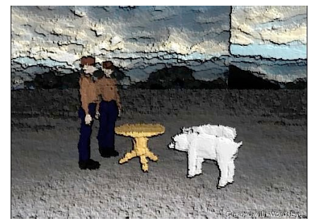
Figure 2: HEAF Student-created scene from Animal Farm, "Pigs and farmers playing cards".

control curriculum was determined and implemented by HEAF without interference from the researchers. It consisted of a variety of activities ranging from book discussion groups to the development of an original puppet show. There was some technology integrated into a number of those activities, consisting of word processing, Internet searches, and visual design software (Adobe Photoshop). The control and treatment groups spent the same amount of time on their activities. Over the next 5 weeks, the WordsEye group used WordsEye for 90 minutes a week to create scenes from the literature they read, including Aesop's fables and Animal Farm .