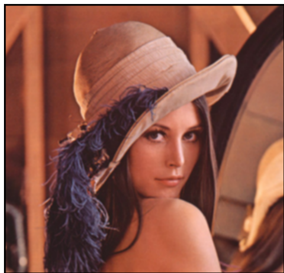
(b) Blurred Output Image