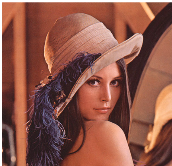
(a) Input Image