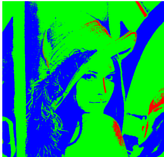
(b) Segmented Output Image