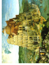
Pieter Bruegel, The Tower of Babel , 1563