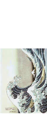
Martin Richards, Cambridge, 1967

Typeless Everything a machine word (n-bit integer) Pointers (addresses) and integers identical Memory: undifferentiated array of words Natural model for word-addressed machines Local variables depend on frame-pointer-relative addressing: no dynamically-sized automatic objects Strings awkward: Routines expand and pack bytes to/from word arrays