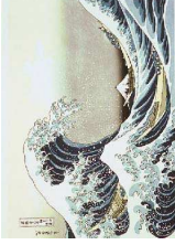
Katsushika Hokusai. In the Hollow of a Wave off the Coast at Kanagawa , 1827